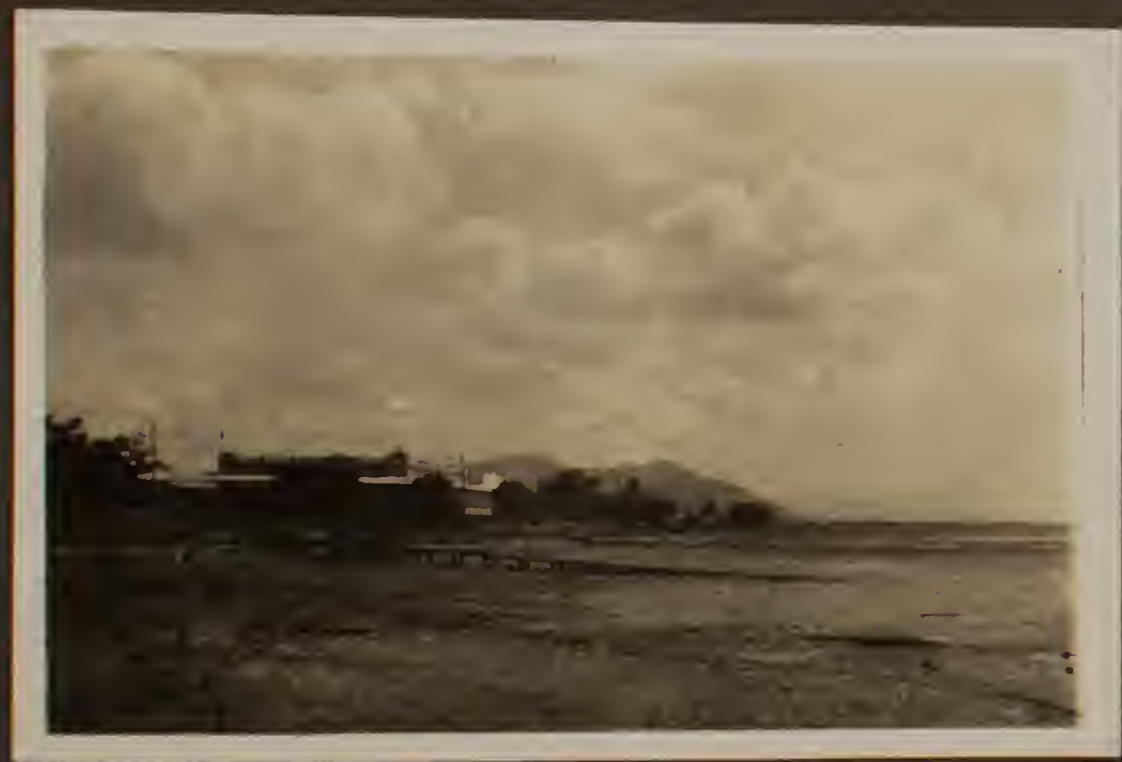
Mud flat - Sun foot